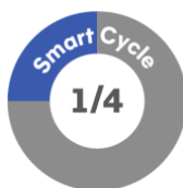
Intrauterine Insemination (IUI) or Timed Intercourse