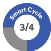
IVF Freeze-All Cycle