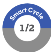
Pre-Transfer Embryology Services