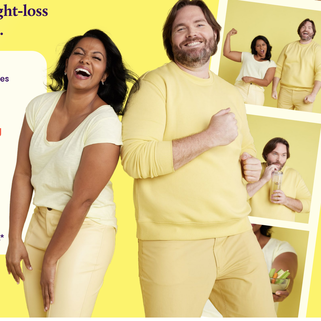
Get started today at wondrhealth.com/cpchem

and be your healthiest self— while eating the foods you love. Our program is based on behavioral science and takes a personalized approach that fits into your life—at no cost to you.*